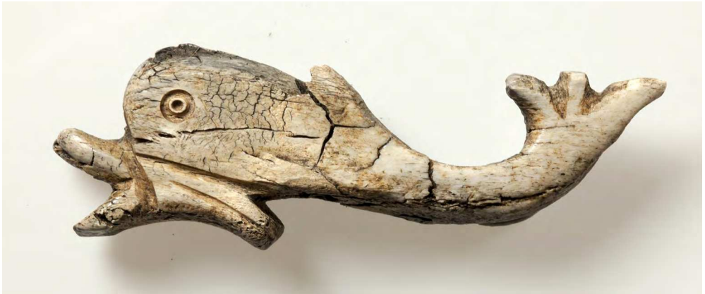
Fig. 5.—Left and right side of the dolphin from Kaiseraugst- Im Sager 1991.002.C07596.2. Length 6.5 cm.