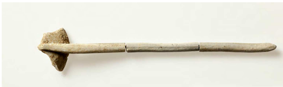
Fig. 2.—Three fragments of a spoon from Kaiseraugst- Im Sager 1991.002.C09392.19. Length ca. 6.5 cm.

decorated with a point. These points are regularly found on spoons that are typical of the 1st century AD. This detail can be helpful for the identification of such objects even when the fragment is very small. However, that cannot be said about the handle fragments. When such rods are found in isolation they could also be identified as part of a hairpin (Deschler-Erb, 1998:159-166) or a needle (Deschler-Erb, 1998:140-142), so their function cannot be determined with confidence.