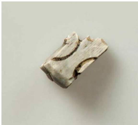
Fig. 1.—The fragment of a dice from Kaiseraugst-Im Sager 1991.002.C09367.157. Length 0.5 cm.