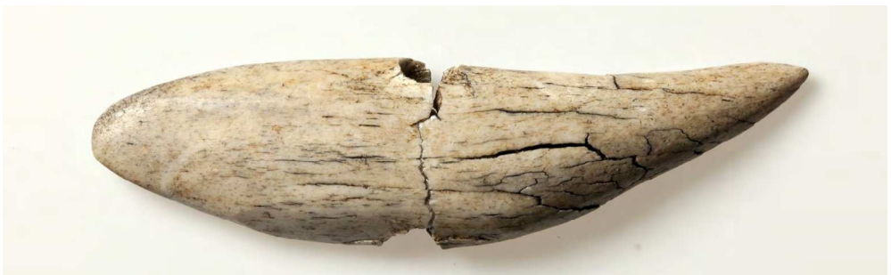
Fig. 6.—The dolphin/fish (?) from Kaiseraugst- Im Sager 1991.002.C07612.4. Length 5.7 cm.