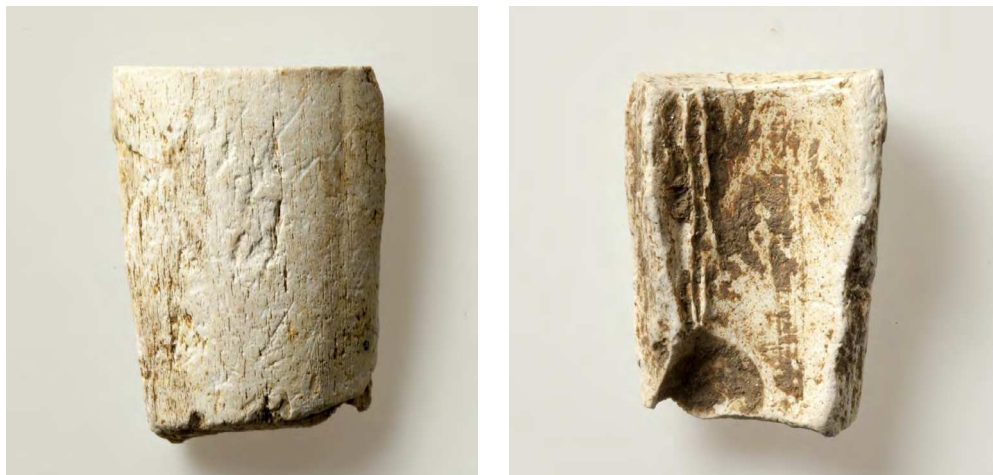
Fig. 3.—Outside and inside of a hinge from Kaiseraugst- Im Sager 1991.002.C09190.70. Length 1.8 cm.

cylinder. The craftsmen obviously stopped drilling too late and touched the opposite side with the drill, so that is the proof that we have a fragment of a hinge. Roman bone hinges are cylinders, usually with one or more holes, into which wooden plugs were fitted, and used as pivots for doors and lids (Deschler-Erb, 1997; Deschler-Erb, 1998:182-189). The object shown in fig. 4 is worked on the outside and the inside. The border is not straight-edged like the hinge, but rounded. Furthermore, there is a shallow rim carved on the inside margin. That can only be found on so-called pyxides . The bottom or the cover of the pyxis was set upon this rim. Pyxides were used as containers for unguents and creams and were often placed in the grave as personal effects of the dead (Béal/Feugère, 1983; Deschler-Erb, 1998). This shows that different technical details can help to identify bone artifact types.