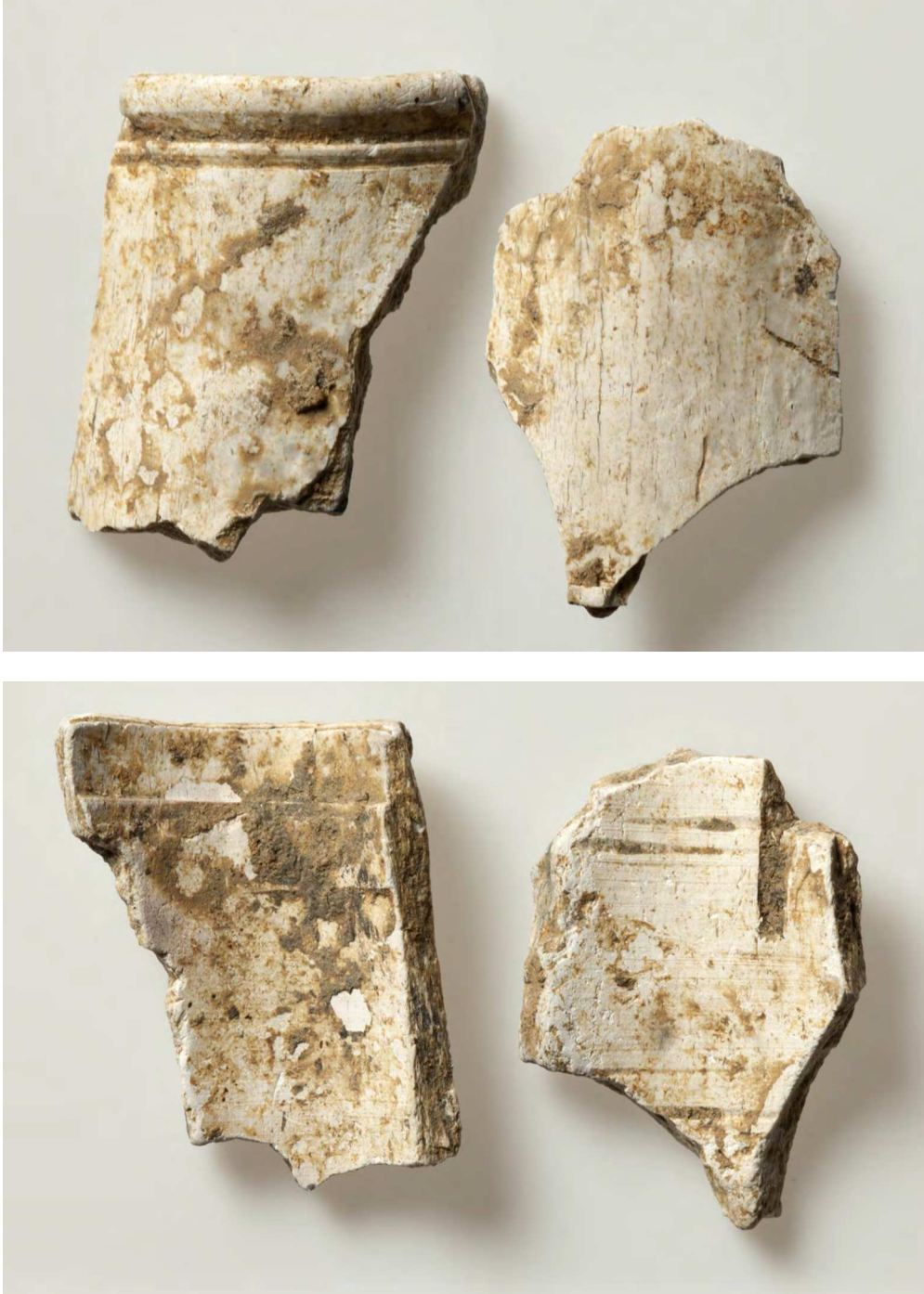
Fig. 4.—Outside and inside of a pyxis from Kaiseraugst- Im Sager 1991.002.C09048.24. Length ca. 2 cm.